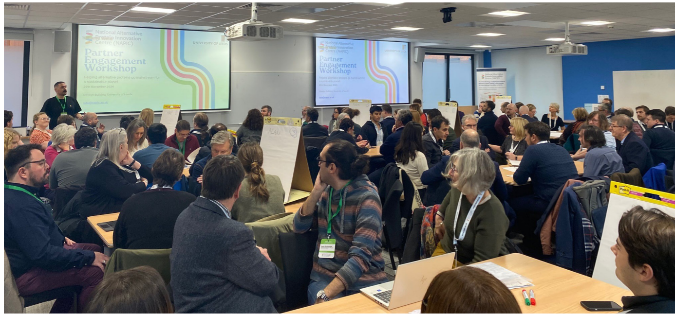
Figure 2: Partner Engagement Workshop.